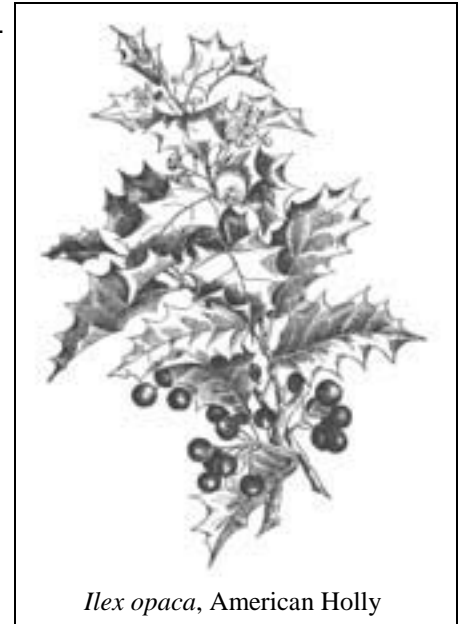
Ilex opaca , American Holly

Things to remember: Fishing is available in the pond at the Camp and there is a wonderful deck that overlooks the pond where visiting and drinking coffee will be very nice. No boats are allowed, and alcoholic beverages are not permitted on the grounds. The costs for lodging and food are shown on page 4. Please indicate which nights you will be staying.