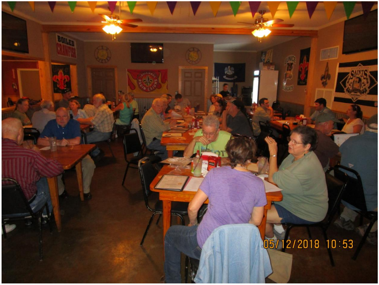
The attendees after the tour gathered at Rocky's Restaurant in Eunice.